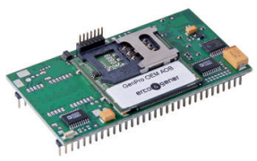
GenPro OEM AOB