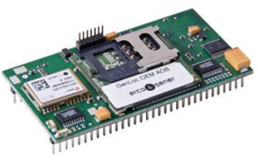
GenLoc OEM AOB