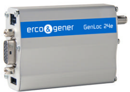
GenPro 24e AOB