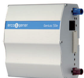
GenPro 53e and GenLoc 53e