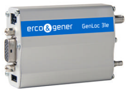
GenLoc 31e AOB